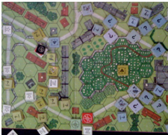
Figure 1: End of Turn 1 Force Dispositions

I decided that reaching the R row rowhouse was too risky for turn 1 and instead wanted to control the P row after turn 1, particularly road hexes P9 and Q1. I planned to place the elite infantry as far forward in the north as the O8-P8 rowhouses as I saw the graveyard as a potential avenue for panzerfaust-wielding German infantry to move back and forth to deny American movement along either main road. The remaining second line infantry would establish a blocking position in the large J3-K4 building where they could theoretically skulk and shoot. With their mobility and capable 50L gun, I decided that the three PSW 234/2s could set up forward overwatch positions while the two SP 251/22s with their 75L guns but B10 limited ammo would hang back and wait to see where the American M24s and M5s headed.