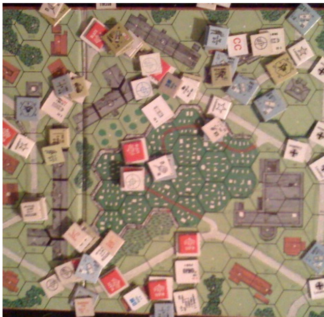
Figure 2: End Game Force Dispositions

Turn 3 saw the Americans attempt a southern board edge push in the confined O1-N1-M1 area but to no avail. Stationary PSW 234/2s took their toll of the moving American armor in the south while an assault by the second line infantry ended the American O1-N1-M1 push. By the end of turn 4, Tom conceded the game after the loss of the last armored vehicle repositioning to support his main effort in the south - the M18GMC was destroyed by a close-in blitz from a PSW 234/2 and a SPW251/22 in the graveyard.